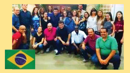
Welcome CFI-BRAZIL Team Praying for Israel