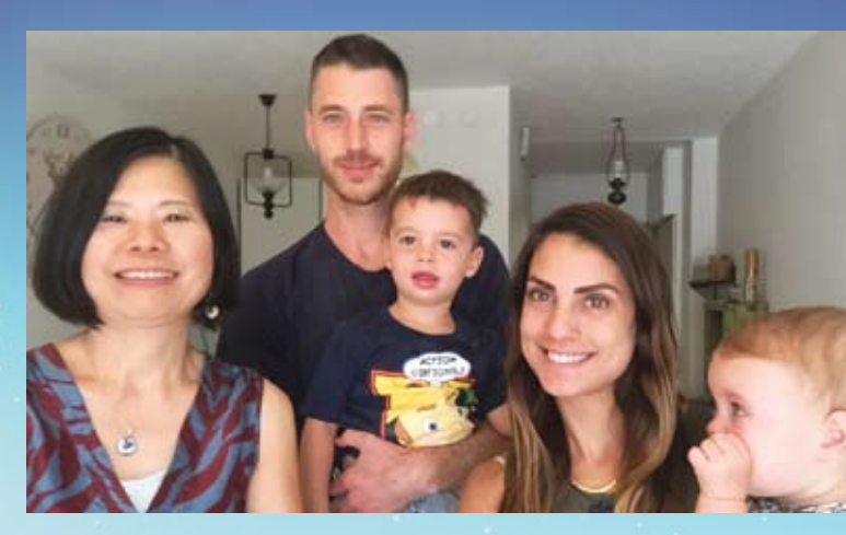
Building relationships with a family in Southern Israel

Project CUA has been asked to help a family build a safe room, but it is very costly, so we need your help. To contribute to help them build a safe room, please designate your financial gift to Project CUA, thank you. Through God's help and support from our donors, Project CUA has touched many lives of individual rocket victims, bringing them practical help together with comfort and encouragement from God's words as well as His love reaching into each traumatized heart.