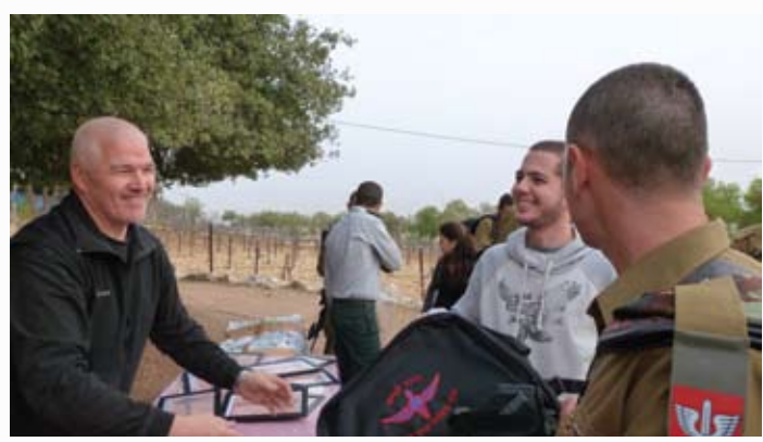
Top: Bonding with Israel's Warriors Below: Providing special backpacks for a Soldier's Unit

our affirmation of their doing a great job. Taking these items of comfort, help and support to army bases allows us to look Israel's soldiers in harm's way, in the eye, and with sincerity from our hearts say, "Thank you for doing your job! You are appreciated!"