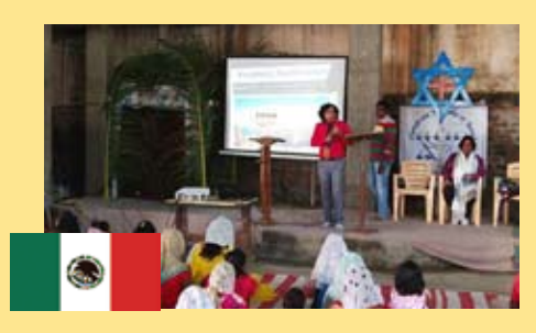
CFI–INDIA Conference in Maharashta,