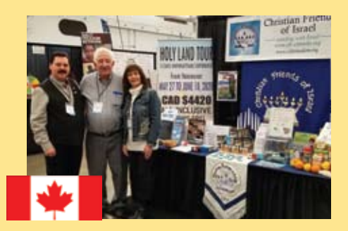
CFI–CANADA Event Booth Missions – Fest Vancouver