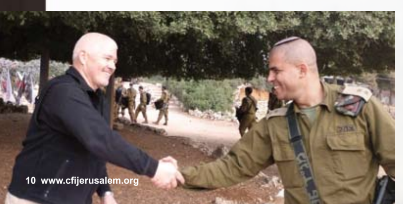
Christian and Jewish Brotherhood

CFI continues to provide practical needs such as backpacks, hats, jackets, t-shirts, and even doughnuts, but even more spiritually essential is