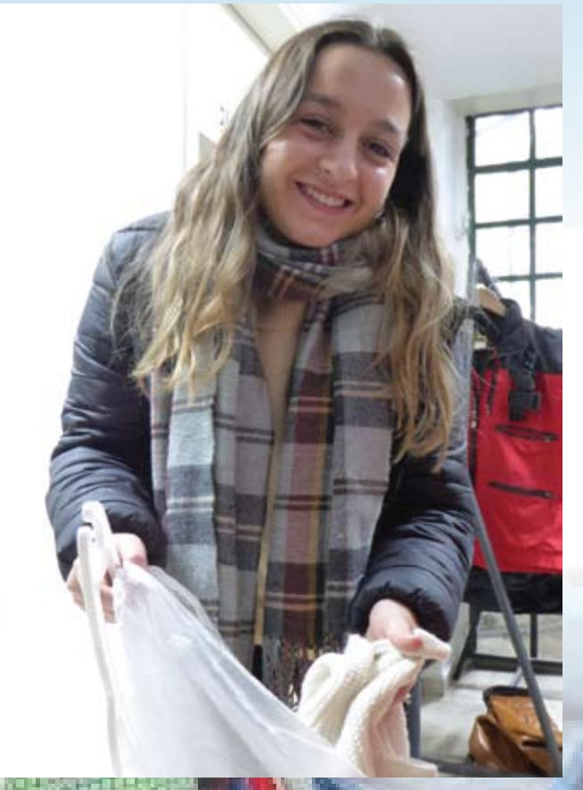
When people are helped, they smile

and Finland were to quickly follow sending boxes. Boxes were everywhere in our home, friends stored them for us until a truck would come to take them to the shipping docks. By this time, we had 800 boxes in one shipment and our largest was 1,000 boxes.