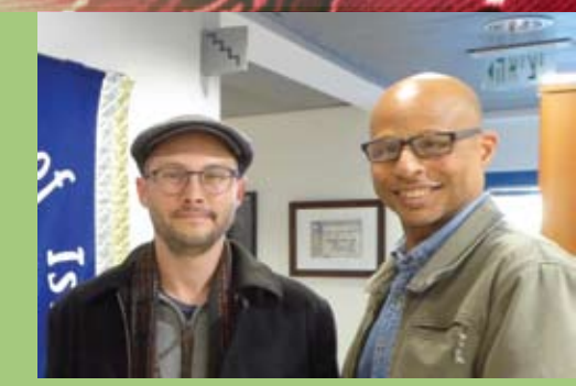
School Tuition: Jewish man with 4 children working in 2 ministries in the Land. Assisted him with his adolescent daughter's private school tuition.

FIRST FRUITS Encouraging the Household of Faith