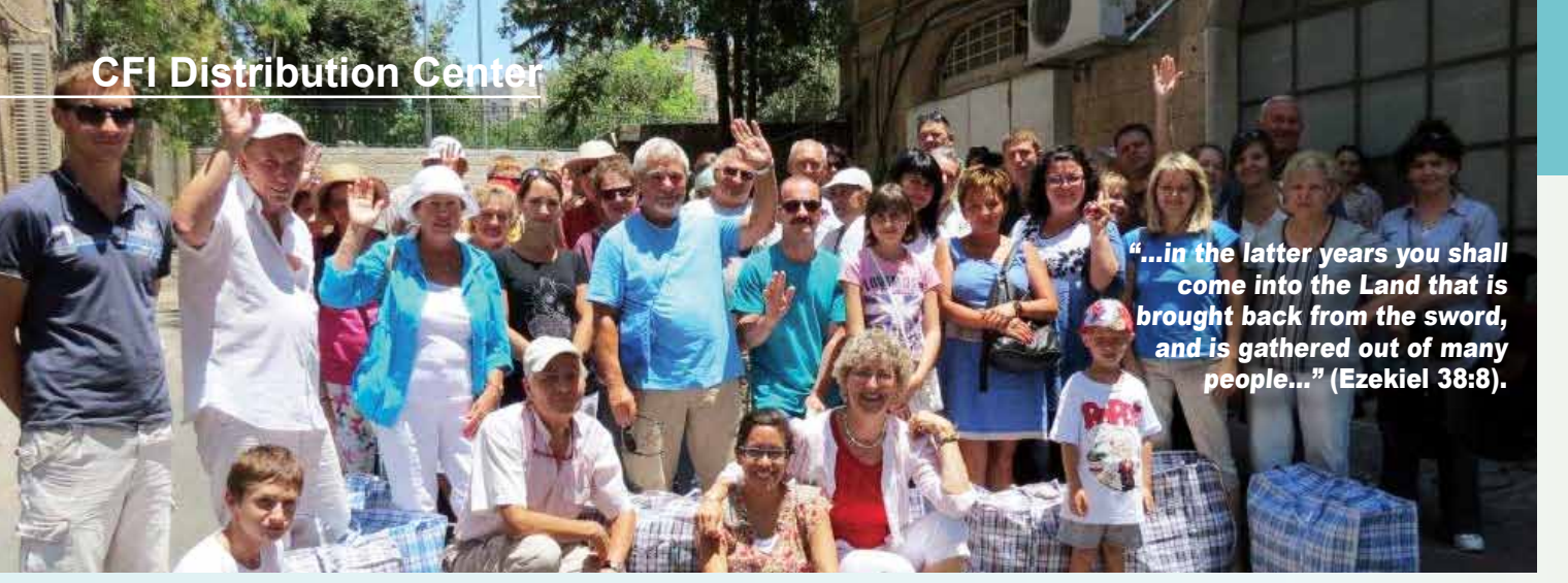
Sometimes we have a full house