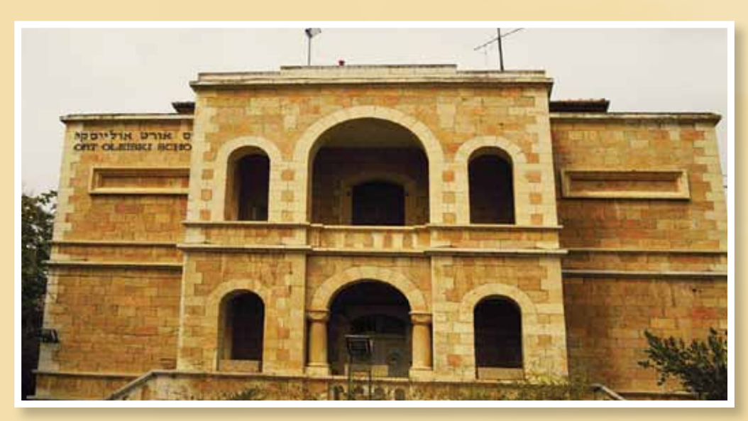
Proposed Ministry building located on a unique parcel of land in the heart of Jerusalem.