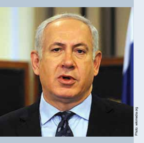
Above: Prime Minister of Israel, Benjamin Netanyahu, needs our fervent prayers

"Israel's leadership must remain vigilant...please keep these leaders in your daily prayers for much wisdom and discernment regarding Israel's enemies' plans to bring death and destruction to the Jewish people."