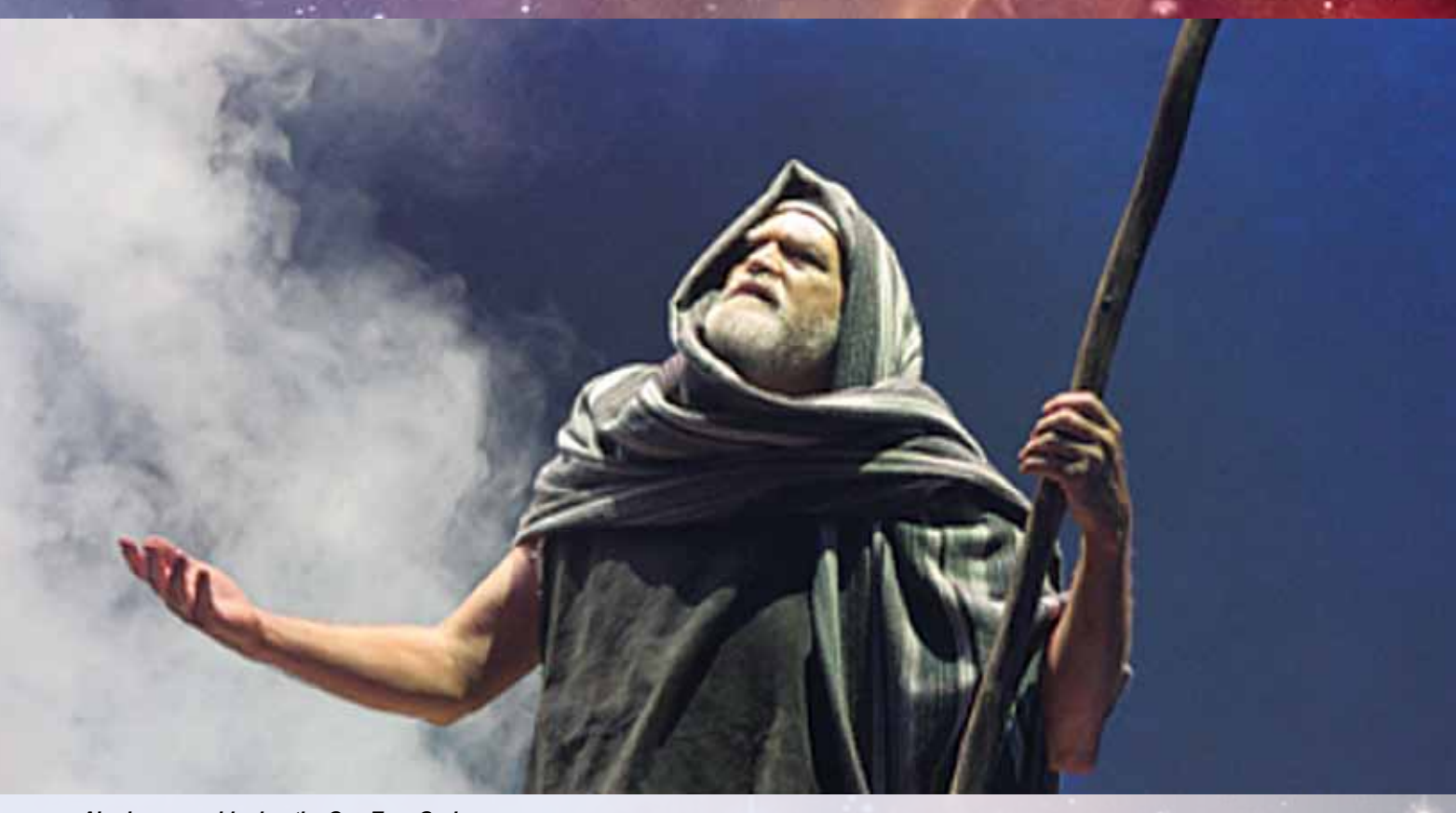
Abraham worshipping the One True God