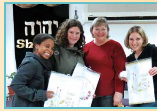
Receiving Shabbat covers