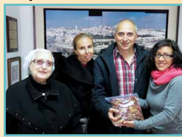
Sharing gifts of donated dried fruit