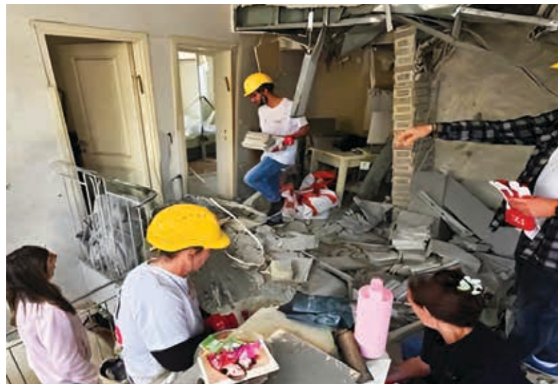
CFI Restoration and Construction Team

The largest project was the renovation of a bomb shelter in the northern border town of Shlomi. We were asked to renovate their security base and install a kitchen and bathroom so the unit could function normally during the war. We did so. We also were able to donate and install large TVs to watch their cameras, which are stationed along the border and throughout the village. It is special and such a privilege to participate in the defense of God's land, Israel, in this way.