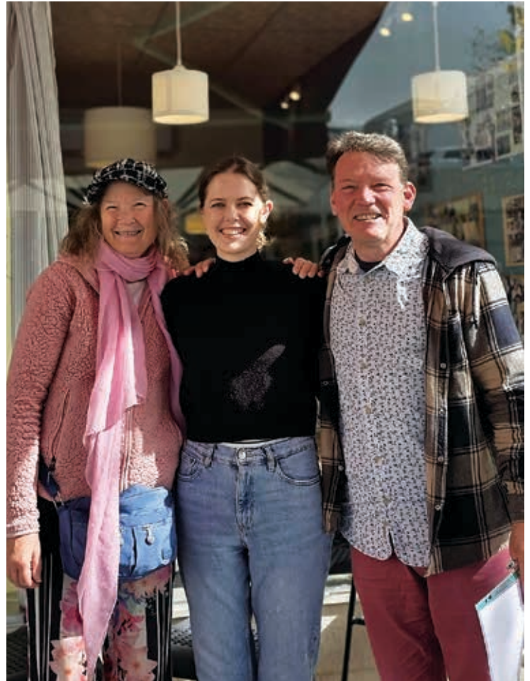
Serving others is so rewarding

This has involved us visiting two congregations to see how we might be able to help. One ministry requested 400 Derek Prince Self-study Bible course books for a Bible college and will use them for teaching. A local prayer house was eager to take Derek's Books in Arabic, Russian and English. We also spent time getting to know each other and praying together. CFI will assist financially with a Women's Night to help 100 single mothers and abused women. They were so encouraged to receive Derek's teachings.