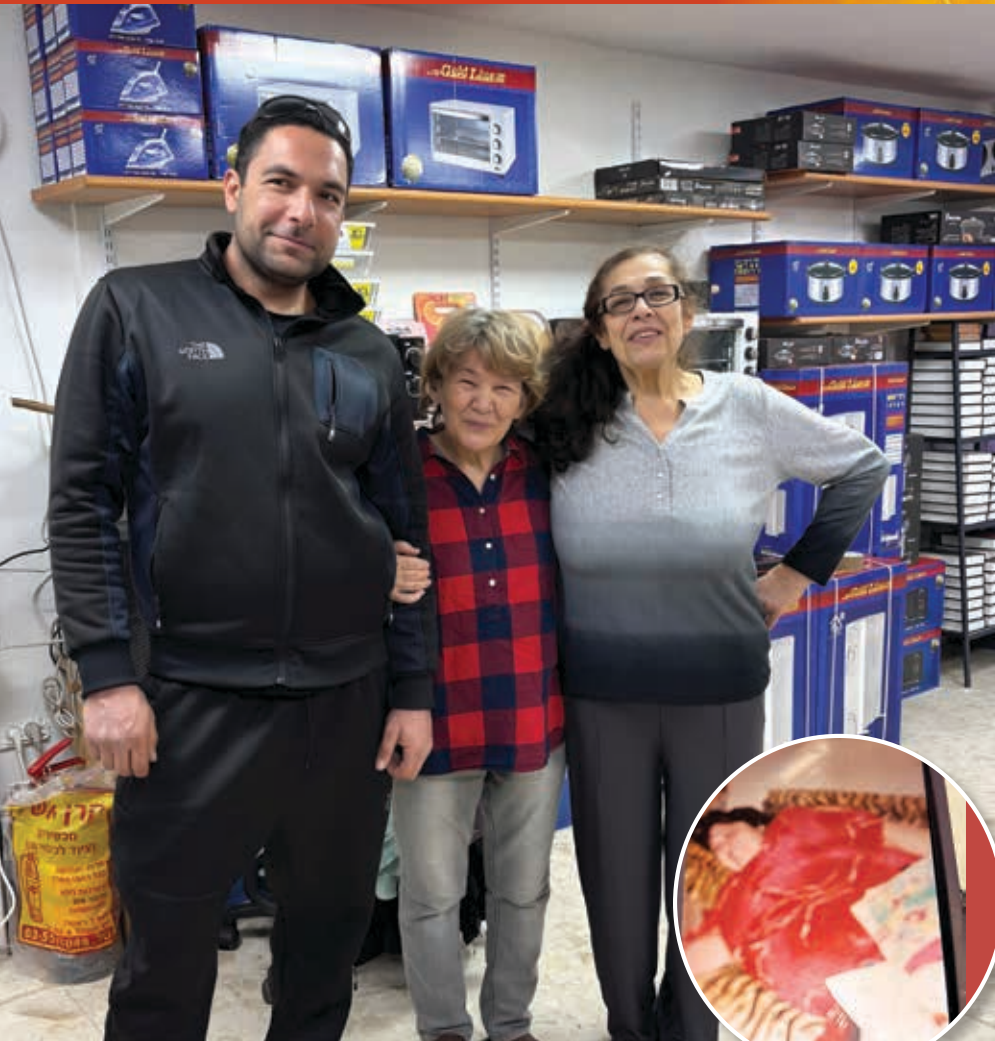
Before the Change