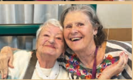
CFI volunteers helping hurting people across Israel