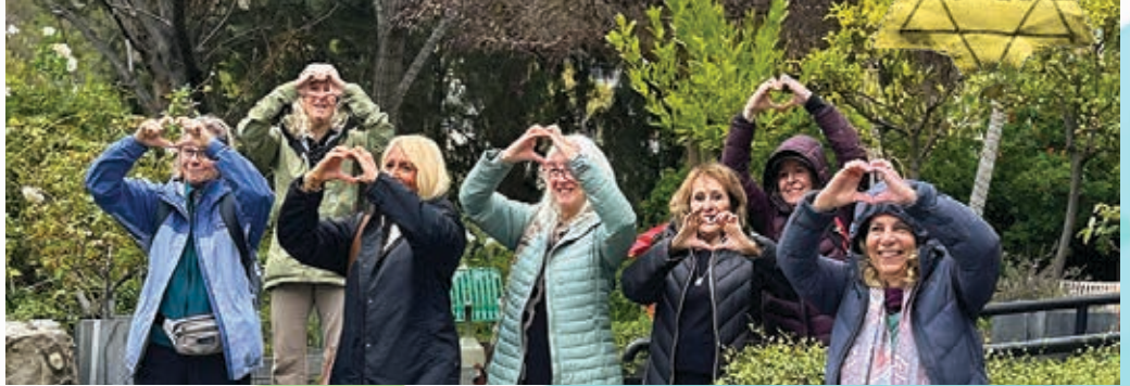
CFI Holocaust team visiting with last living survivors