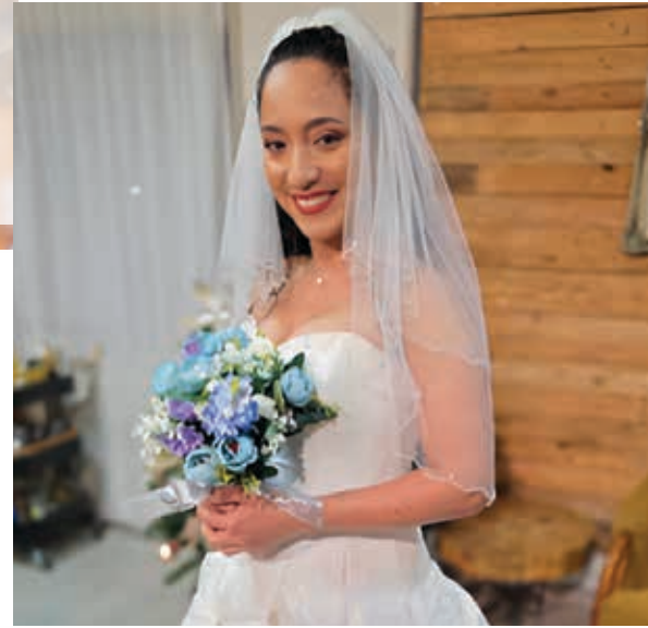
The Joy Bridal Gown Being Worn in Jerusalem