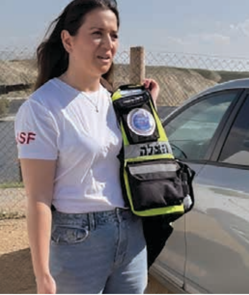
Arriving with Much Needed Supplies

“This is what the Lord God says: I am going to take the Israelites out of the nations where they have gone. I will gather them from all around and bring them into their own land.” (Ezekiel 37:21)