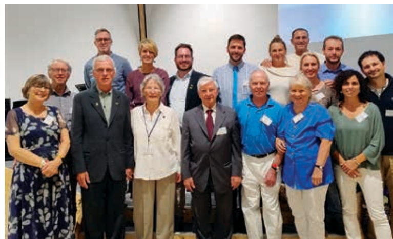
CFI European Conference Leadership

CFI representatives from around the world - especially in this season when many of the offices are earnestly seeking and praying for the next generation to step up to follow in their footsteps. We believe our faith will never be shaken and we trust that the work of CFI will stand for as long as the Lord has ordained it to last - until Yeshua's return if He wills it!