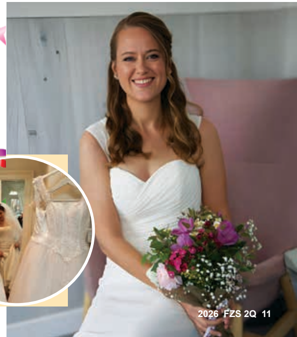
Do you see your gown? Your Gown Made a Bride Feel Special

"TO HIM WHO IS ABLE TO DO EXCEEDINGLY AND ABUNDANTLY ABOVE ALL THAT WE ASK OR THINK." EPHESIANS 3:20