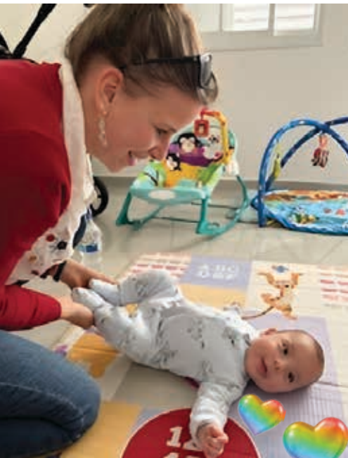
Tending to her little one