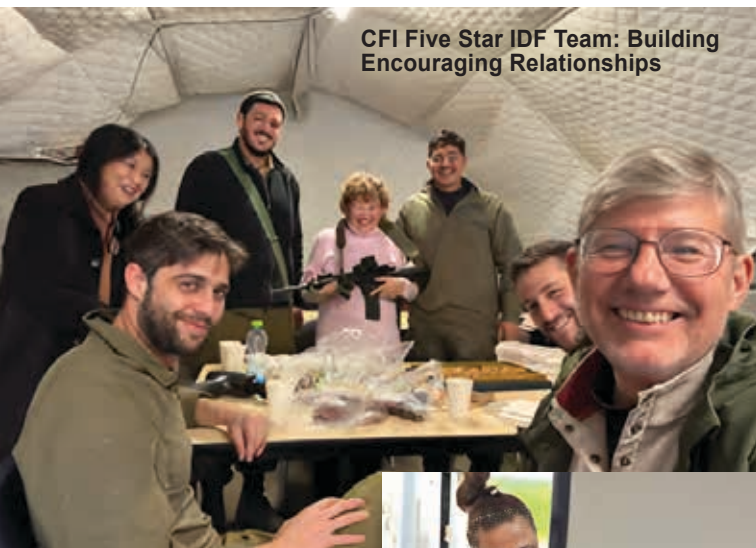
CFI Five Star IDF Team: Building Encouraging Relationships

“Carry with you the vision of our forefathers. The entire nation will stand behind you until victory is sure.” (IDF Chief)