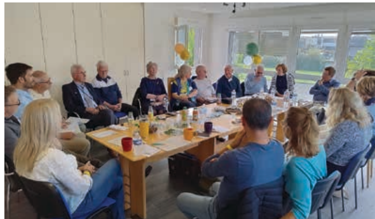
CFI Leaders Meeting in Mulhouse, France

Our CFI Representatives not only garner financial support for our ongoing International Headquarters in Jerusalem but the teaching and project updates they translate into their languages and their stand for truth in their countries, (where the darkness of antisemitism casts long shadows, even in the Christian world). At the CFI European conference in Mulhouse, France, we welcomed CFI representatives from seven European Nations: France, Switzerland, United Kingdom, Netherlands, Belgium, Italy and Germany. Working in meetings online, God has blessed us with the technological tool to truly connect with each other around the world as never before experienced. We find that we have something important to add to the family of CFI and are discovering and developing means to share it with one another. Please pray for