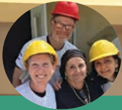
Ready to work