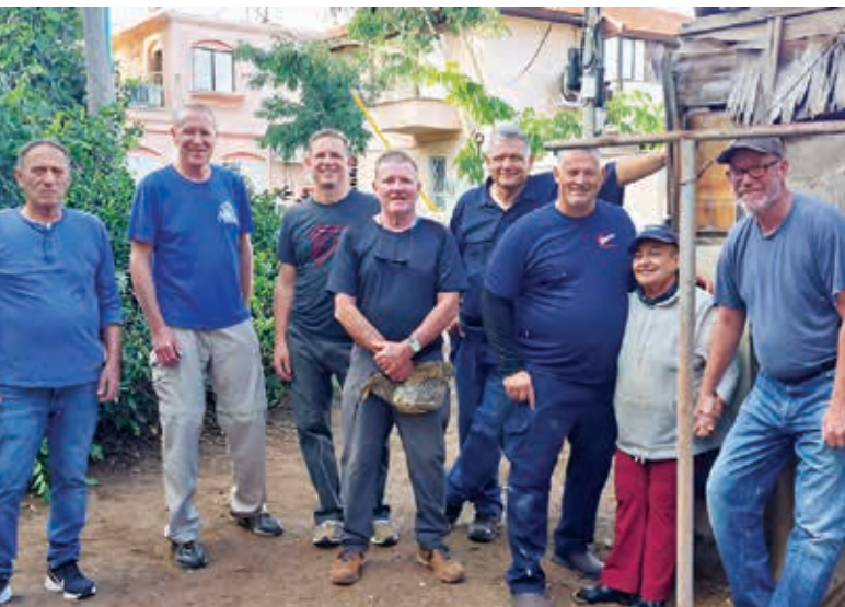
Working together: Making New Friends

“AND LET OUR PEOPLE ALSO LEARN TO MAINTAIN GOOD WORKS TO MEET URGENT NEEDS THAT THEY MAY NOT BE UNFRUITFUL.” TITUS 3:14