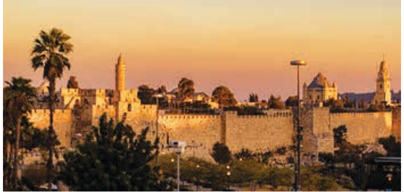
sunrise in Jerusalem

'For thus says the Lord GOD: "Indeed I Myself will search for My sheep and seek them out. As a shepherd seeks out his flock on the day he is among his scattered sheep, so will I seek out My sheep and deliver them from all the places where they were scattered on a cloudy and dark day. And I will bring them out from the peoples and gather them from the countries, and will bring them to their own land; I will feed them on the mountains of Israel, in the valleys and in all the inhabited places of the country. I will feed them in good pasture, and their fold shall be on the high mountains of Israel. There they shall lie down in a good fold and feed in rich pasture on the mountains of Israel." Ezekiel 34:11–14