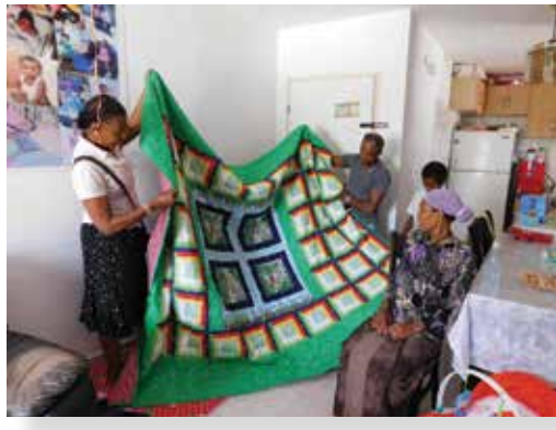
Providing warmth for heart and home