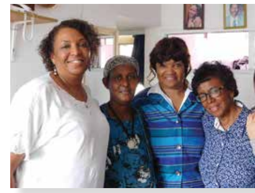
Forging bonds of friendship