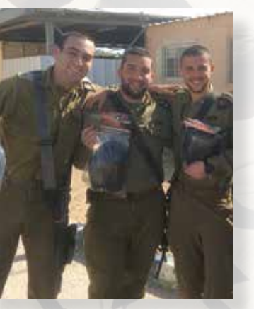
Smiling IDF soldiers with knee pads