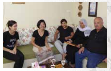
Visits to Shanaan's family