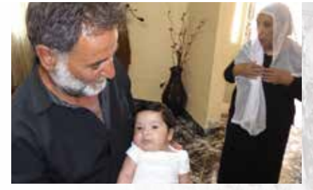
Visits to Sitawe's family