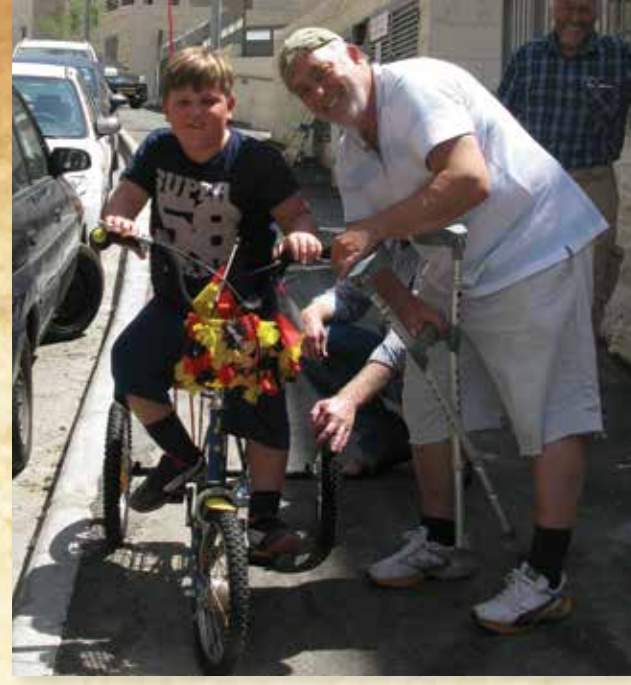
A Special Bike for Little Boy with Crutches