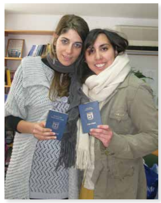
Two young Jewish ladies who made aliyah from Argentina:" We love Zion and that is why we are here."