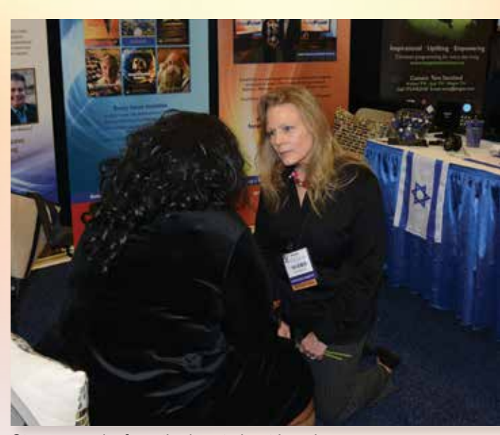
Stacey speaks from the heart about Israel