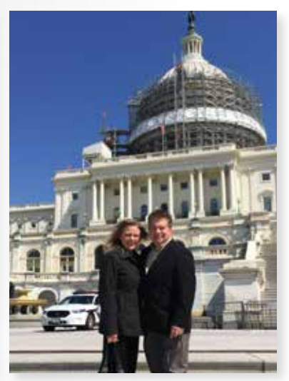
Speaking with U.S. Congress Representatives