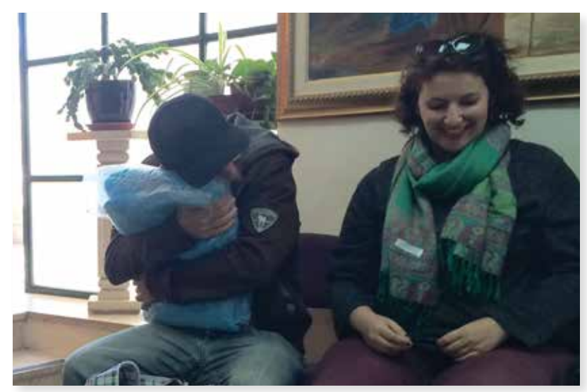
A Grateful New Immigrant Loving His Gift

"CFI DC is having busy months again. We gave record breaking gift packages. Our shipments helped us to give 153% more tons of garments. Gift packages were up 167%."