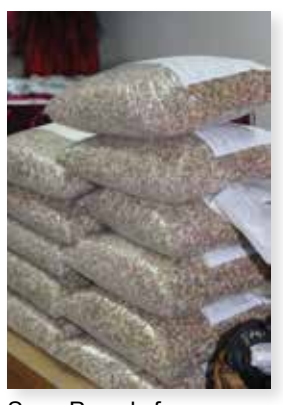
Soup Parcels for the Hungry